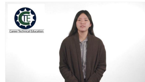
Drivers Ed CTE.mp4